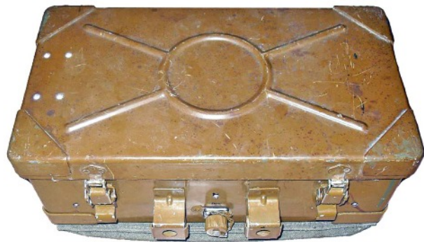
Powering the R-143 during longer and/or static operations a separate metal box with rechargeable batteries was used.