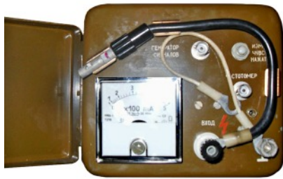
Interface test box for R-143