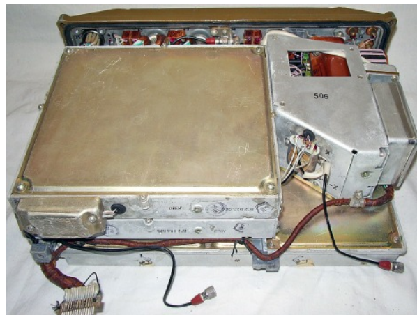
Internal view of the R-143 showing its modular construction