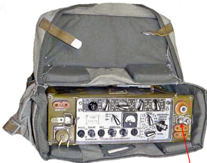
R-143 in its padded carrying bag. Note the remote aerial socket just below the aerial base.

The R-143 (Russian P-143, covert name Bagulnik (Багульник) = Ledum), was a fully transistorised self contained HF manpack transceiver. It was primary designed and used for communication by special forces e.g. forward reconnaissance. The set was a successor of the R-129 and used in a similar role. Two 12V rechargeable batteries powered the R-143. On receive only 12V was used, for transmit 24V was required. In transmit position a relay connected the batteries in series. The power on/off- switch and 24V power socket were located at the side of the battery box at the rear of the set. The frequency was selected by four decade switches. A switch marked '0/1' left of the frequency switches changed between 1.5-10 MHz and 10-20 MHz. In SSB voice mode the radio could be operated at a distance of up to 500m by a field telephone, e.g. a TA-57. A R-014d 'Datchik (Датчик)' high speed data keyer could be connected to the socket normally used for connecting the headset assembly. Noted are R-143 radios with non Cyrillic text which were most probably export versions.