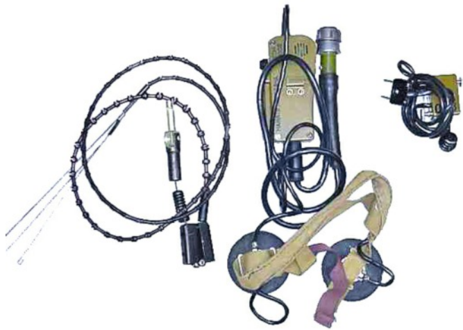
Essential accessories used with the R-129: Kulikov aerial (left), headset and microphone assembly (centre) and miniature Morse key (right; see also chapter 251).