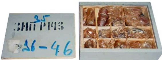
R-143 running spares parts box