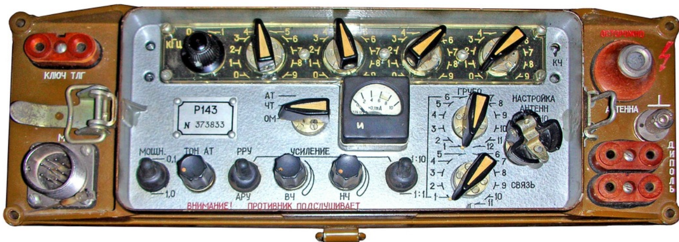
R-143 'Bagulnik' Country of origin: USSR