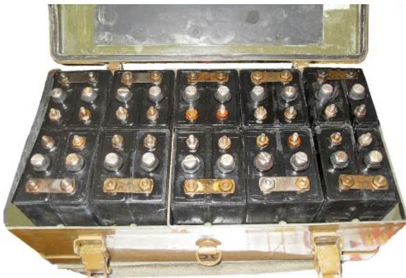
External rechargeable battery pack.